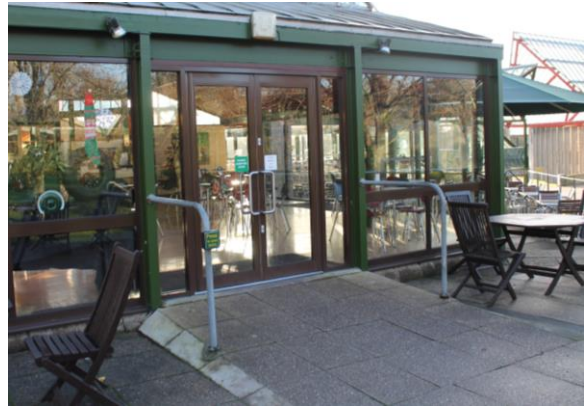
Fig. 8 – Power assisted doors to Brabazon restaurant.