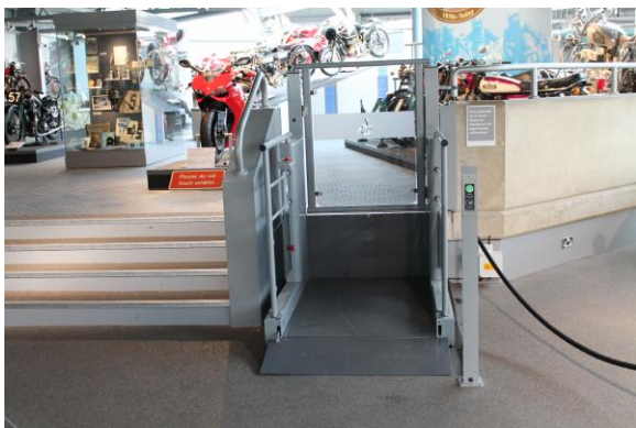
Fig. 11 – Lift for steps on mezzanine level