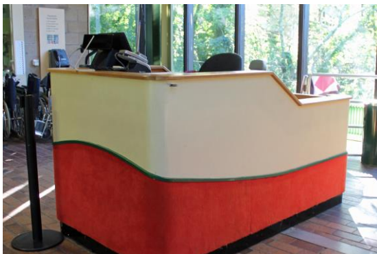
Fig. 3 – Customer till point.