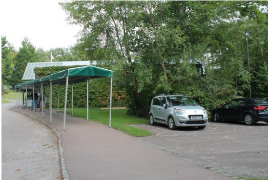
Fig. 1 – Main pathway from disabled car park to Visitor Reception.