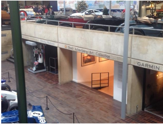
Fig. 13 – Example of booths and ramp access