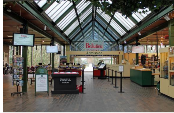
Fig. 2 – Interior of Visitor Reception