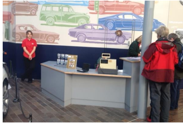
Fig. 14 – Information desk in the museum with DVD player