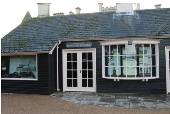
Fig. 27 – Entrance to Secret Army Exhibition