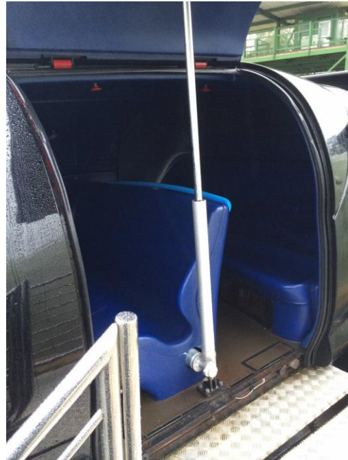
Fig. 20 – Door to the Top Gear simulator