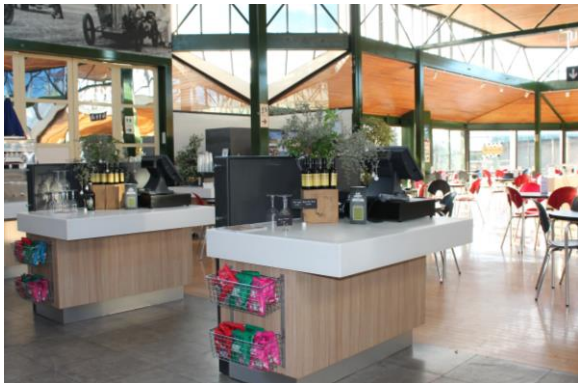
Fig. 9 – Till points in Brabazon restaurant