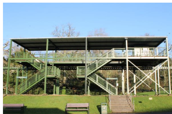
Fig. 28 – North Monorail Station