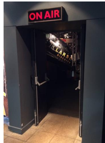
Fig. 16 – Top Gear entrance doors