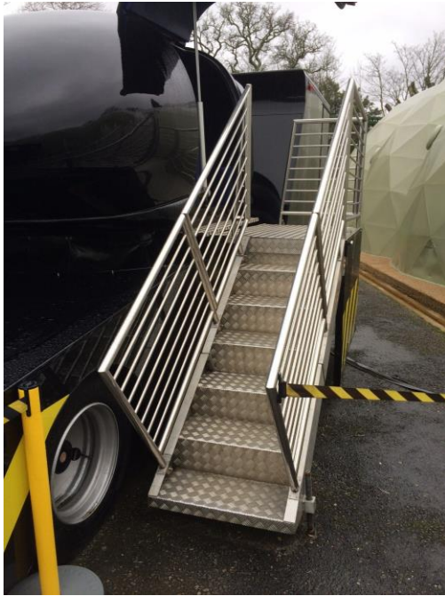
Fig. 19 – Steps to the Top Gear simulator