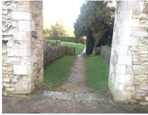
Fig. 24 – Additional compact gravel pathways leading through ruins