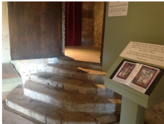
Fig. 26 – Stairs up to Domus (no handrail). Image book of Domus.