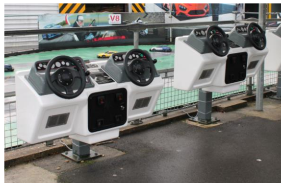
Fig. 18 – Lowered control panel for World of Top Gear Test Track Challenge