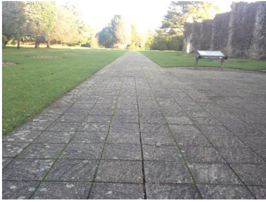
Fig. 23 – Paved ground surface around the Abbey & Cloister