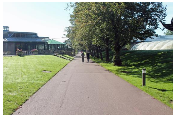
Fig.4 – Main pathway leading through site.