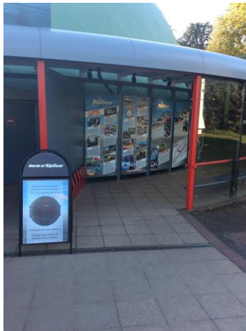
Fig. 15 – Paved walkway to the Top Gear Enormodrome