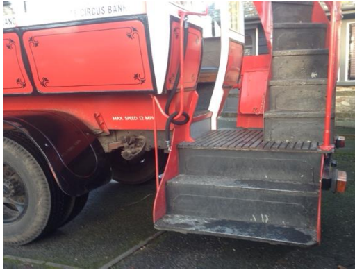
Fig. 29 – Steps to access Veteran Bus