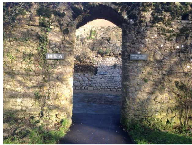
Fig. 22 – Wheelchair access route for the Abbey and Domus