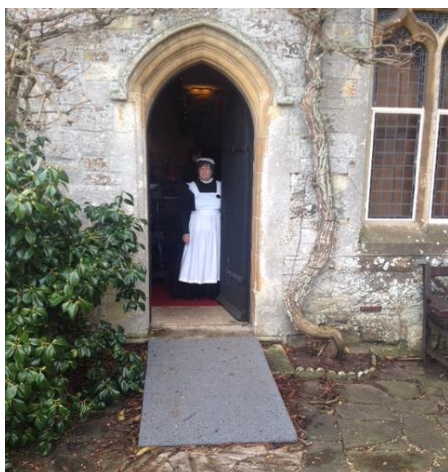
Fig. 19 – Private entrance to allow access to lower floor of Palace House.