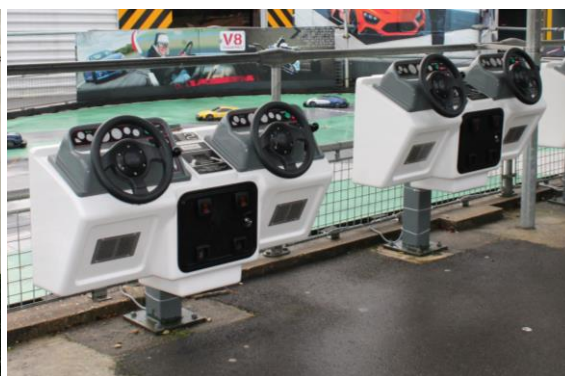
Fig. 18 – Lowered control panel for World of Top Gear Test Track Challenge