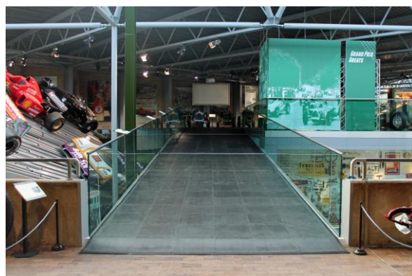
Fig. 12 – Ramp to mezzanine level