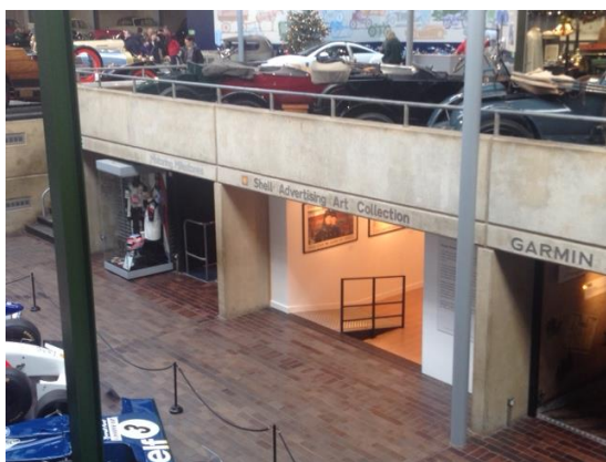
Fig. 13 – Example of booths and ramp access