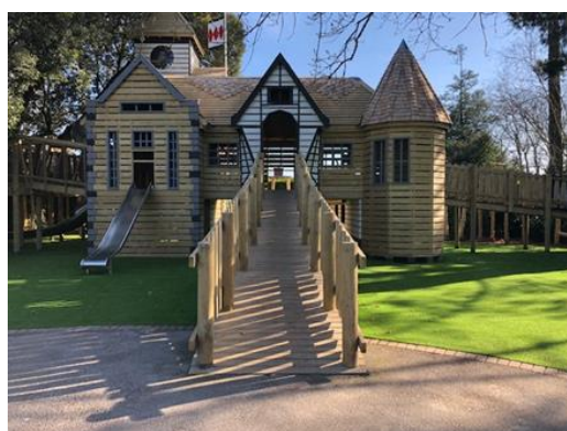
Fig. 28 – Ramp to Little Beaulieu main play structure