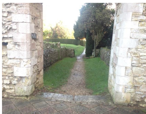
Fig. 22 – Additional compact gravel pathways leading through ruins