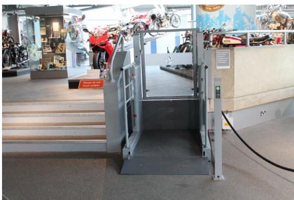
Fig. 11 – Lift for steps on mezzanine level