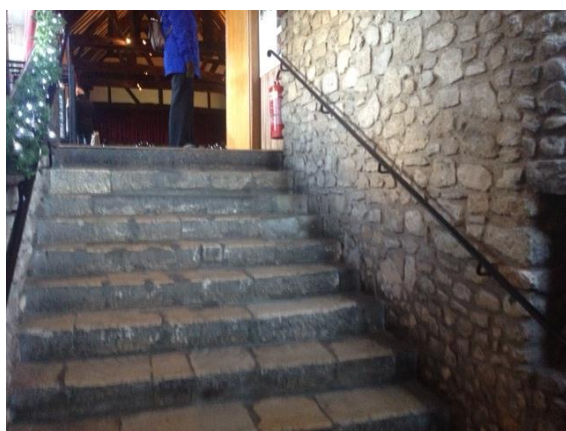
Fig. 23 – Staircase with handrail leading up to the Domus