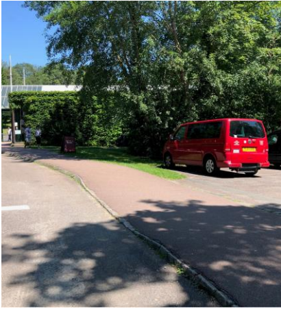
Fig. 1 – Main pathway from disabled car park to Visitor Reception.