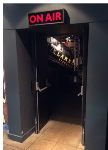
Fig. 16 – Top Gear entrance doors