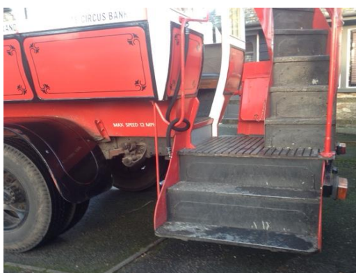
Fig. 27 – Steps to access Veteran Bus