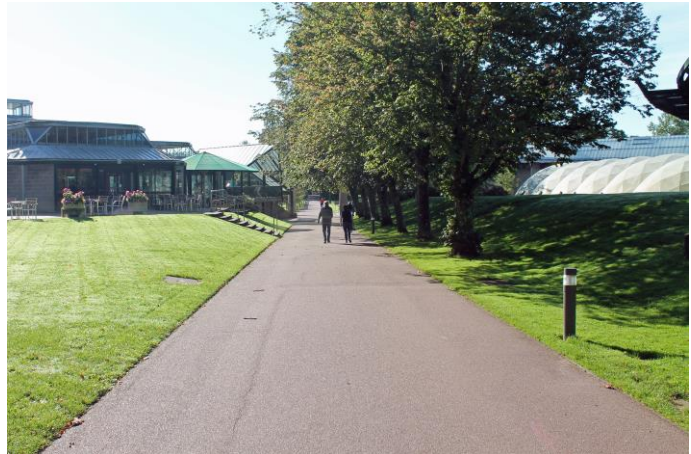
Fig.4 – Main pathway leading through site.