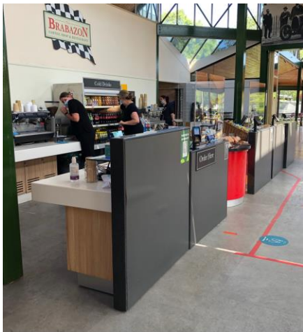
Fig. 9 – Till points in Brabazon restaurant