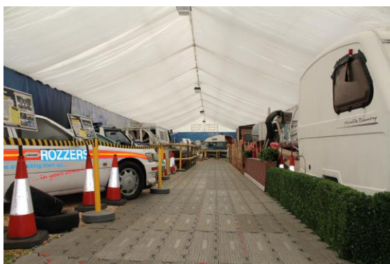
Fig. 17 - Plastic footway in the Top Gear marquee exhibition space