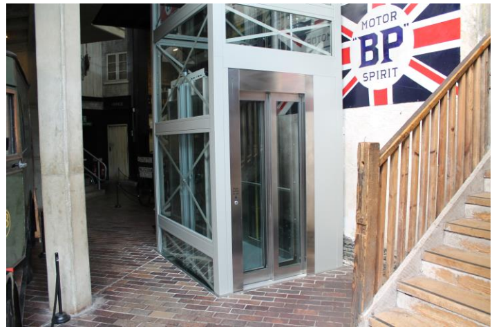
Fig. 10 – Lift from mezzanine to ground floor