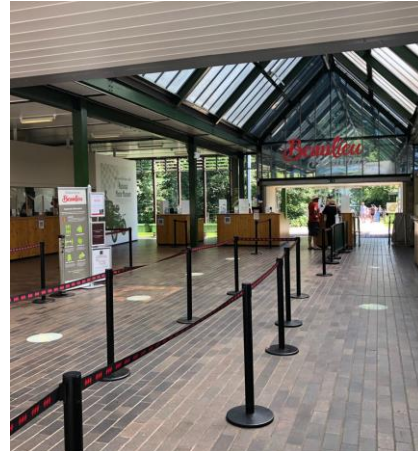
Fig. 2 – Interior of Visitor Reception