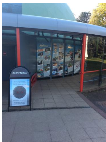
Fig. 15 – Paved walkway to the Top Gear Enormodrome