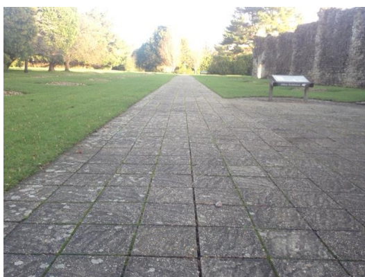
Fig. 21 – Paved ground surface around the Abbey & Cloister