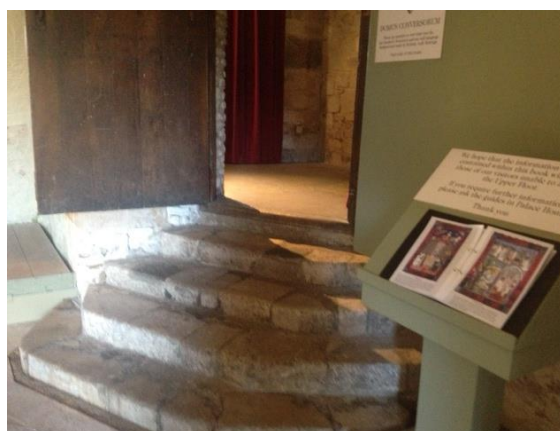
Fig. 24 – Stairs up to Domus (no handrail). Image book of Domus.