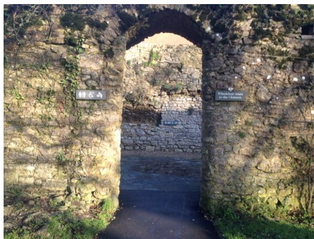
Fig. 20 – Wheelchair access route for the Abbey and Domus