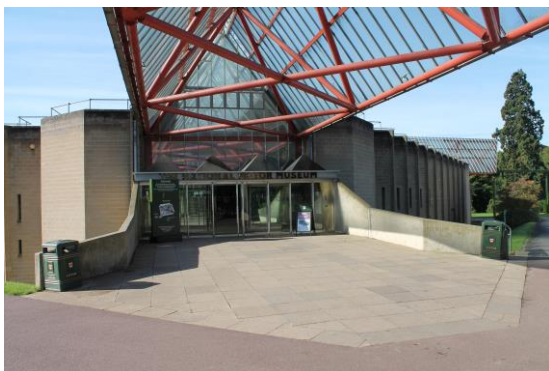
Fig.5 – Access to National Motor Museum from main pathway.