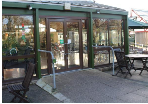
Fig. 8 – Power assisted doors to Brabazon restaurant.