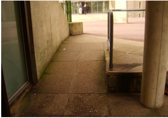
Fig. 7 – Entry to accessible lavatories from main pathway.