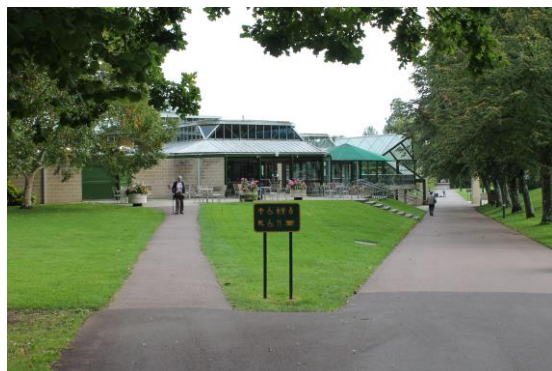
Fig.6 – Access to Brabazon restaurant from main pathway.