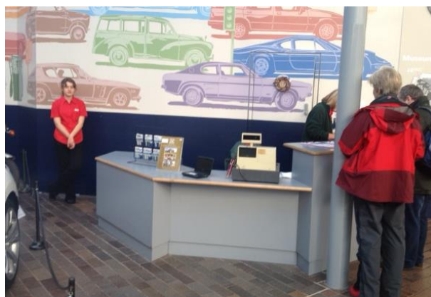
Fig. 14 – Information desk in the museum with DVD player