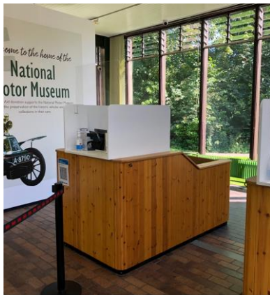
Fig. 3 – Customer till point.